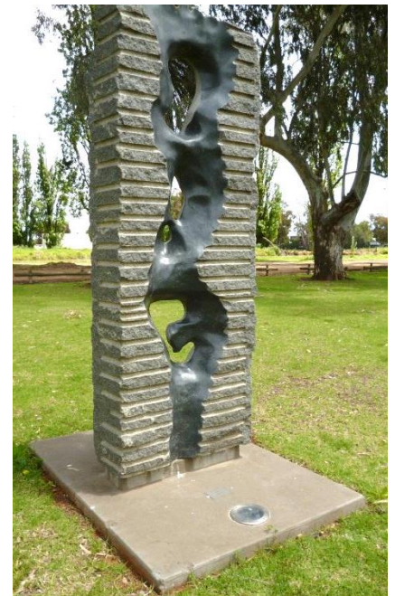
Some of the stone sculptures around Griffiths