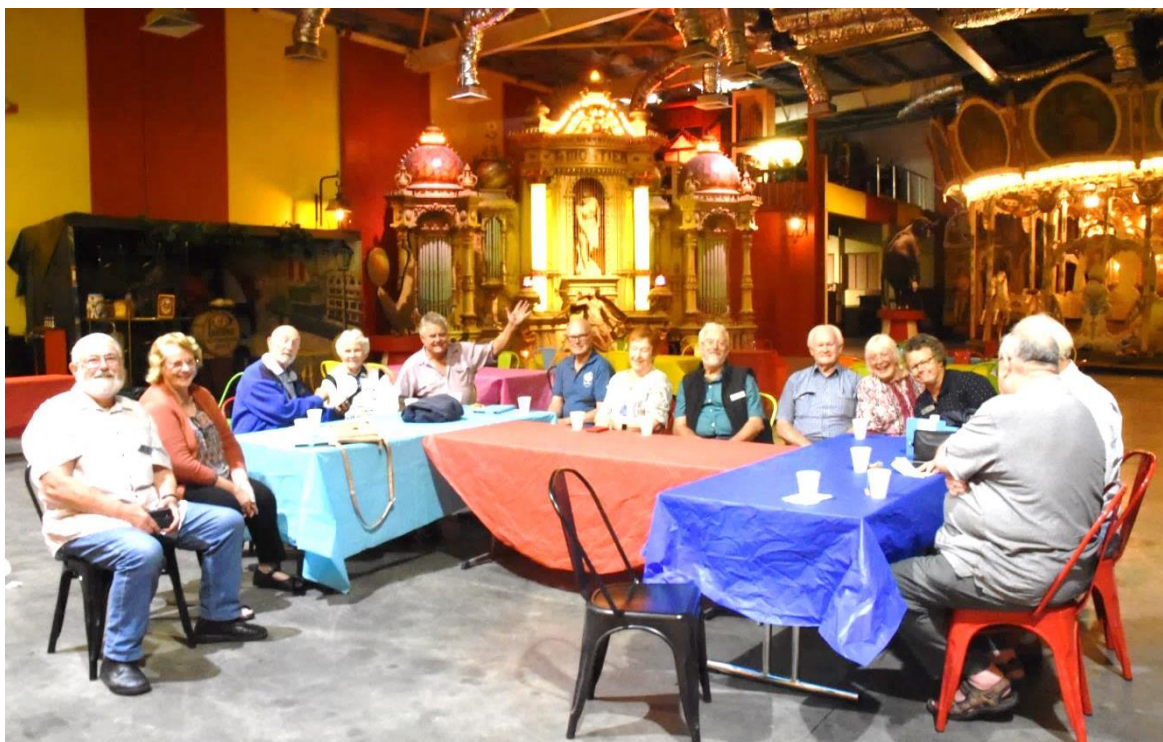
inside Fairground Follies museum.